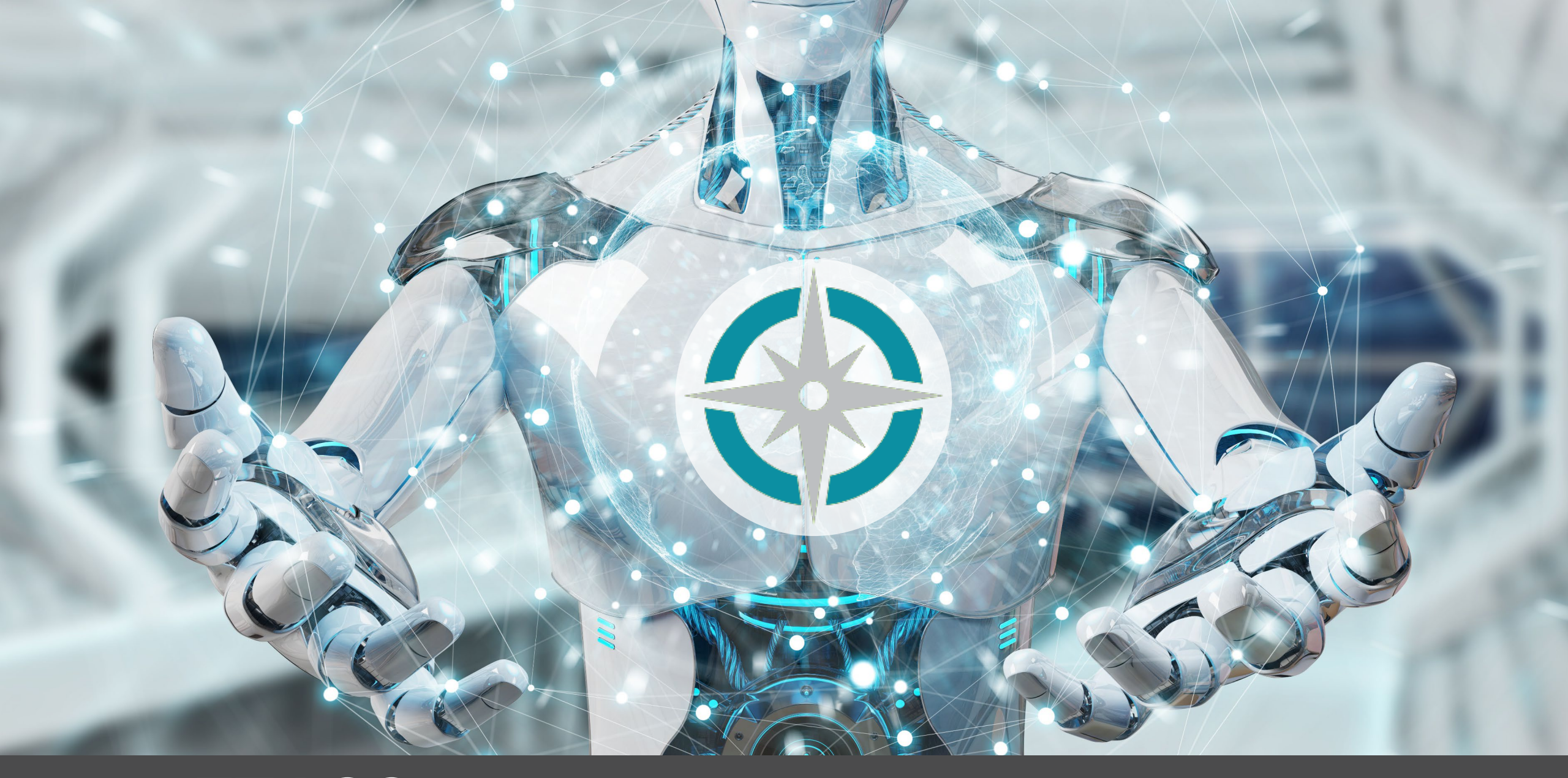
EZASSI – Technology to innovate faster .